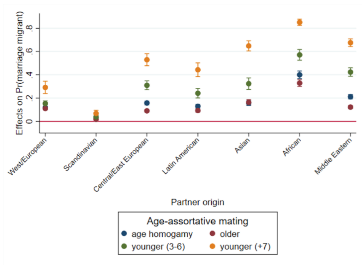
Figure 2. Age-assortative mating in native women's intermarriages across partners' origin groups (Sweden, 1991 to 2009).