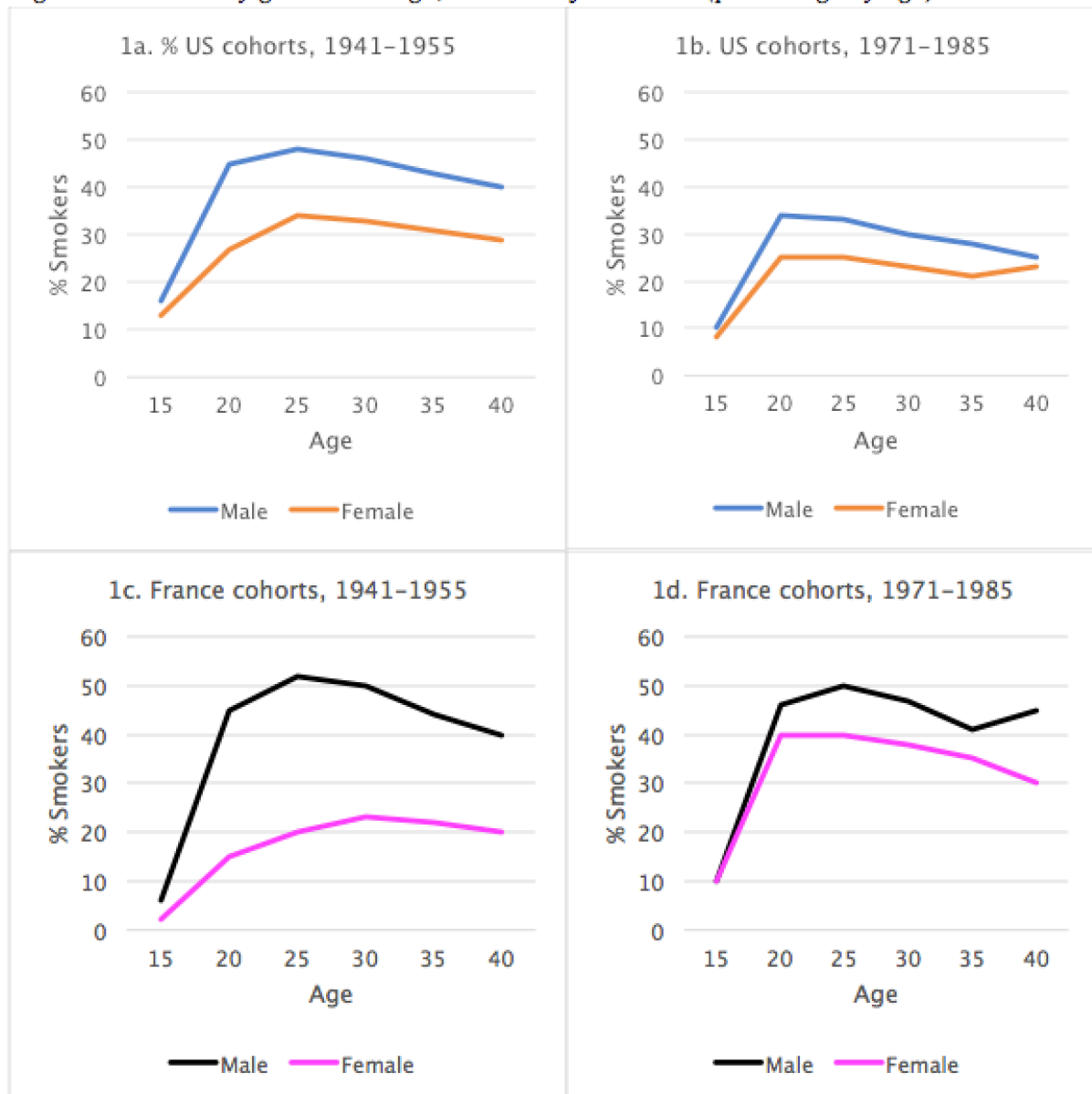
Figure 1. Smokers by gender and age, all levels of education (percentage by age)

Note: the cohorts labelled "1971-1985" do not refer consistently to the entire group: for instance, those born in 1985 are observed only up to 25 years in the 2010 survey from which these data are taken.