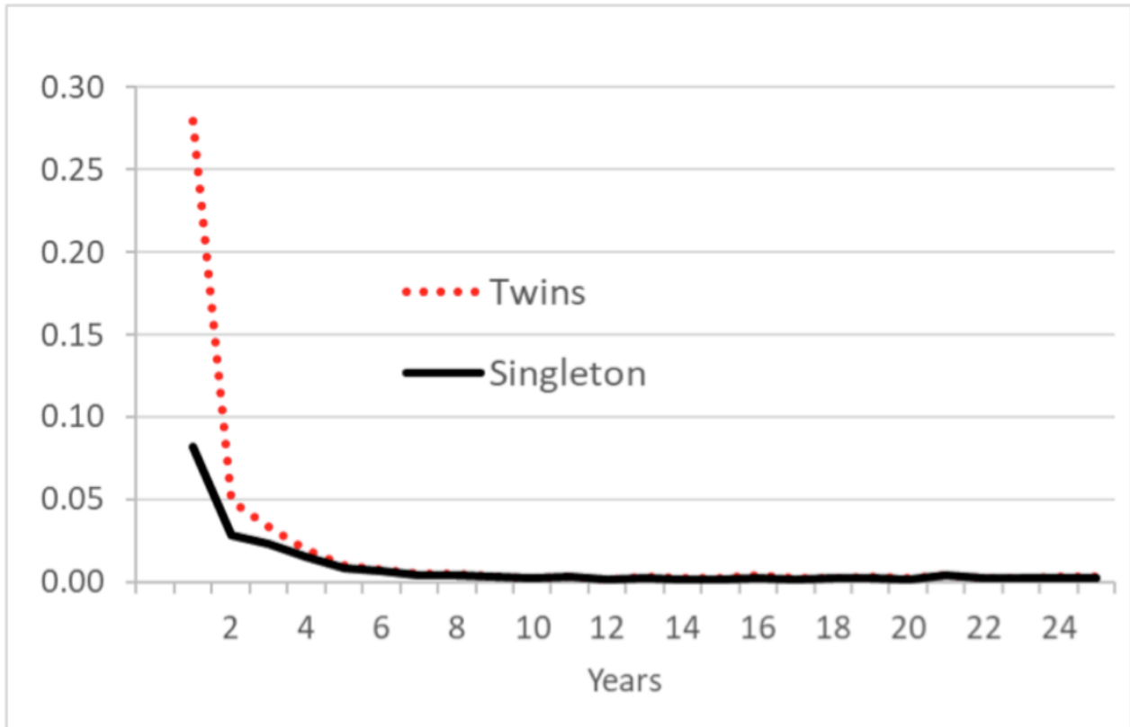
Fig. 2. Mortality of twins and singletons by age (in years) – 34 countries in sub-Saharan Africa