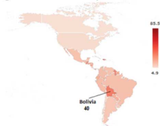
Figure 2: Infant mortality rates, Americas 2010

According to World Bank data, Bolivian neonatal, infant, and under-5 mortality rates were among the highest in the continent—at, respectively, 23, 37, and 47 deaths per 1,000 live births, compared with averages of 12, 19 and 23 deaths per 1,000 live births, respectively, in Latin America as a whole that same year. Moreover, in 2008, Bolivia was one of the most unequal and poorest countries in South America, with widespread chronic malnutrition and one of the continent’s highest poverty headcount ratios. There was marked urban-rural inequality in the distribution of wealth and in the demographic indicators of early-age mortality. Bolivia was also characterized by a large indigenous population, accounting for more than 60% of the total, who were affected by social exclusion in terms of poverty, education, and health (Coa and Ochoa, 2009).