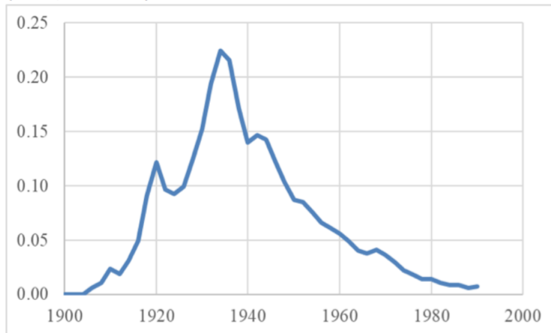
Figure 3 – Proportion of “sandwiched” mothers (i.e. with children less than 10 years of age and at least one parent within five years from average age at death) by year (Brazil, 1900-1990).

Source: 2000 Brazilian Demographic Census, Human Fertility Collection and Latin American Human Mortality Database. Socsim microsimulations.