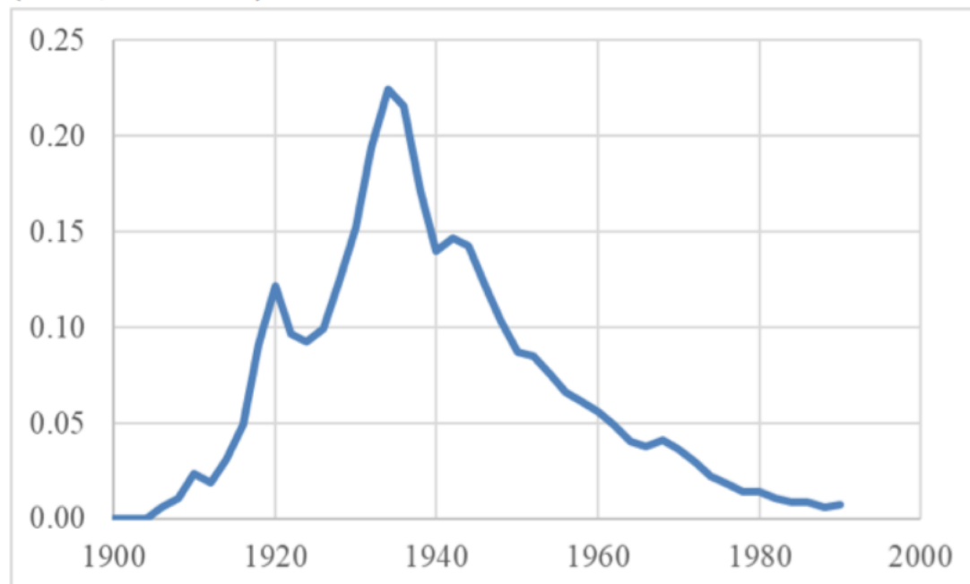
Figure 3 – Proportion of “sandwiched” mothers (i.e. with children less than 10 years of age and at least one parent within five years from average age at death) by year (Brazil, 1900-1990).

Source: 2000 Brazilian Demographic Census, Human Fertility Collection and Latin American Human Mortality Database. Socsim microsimulations.